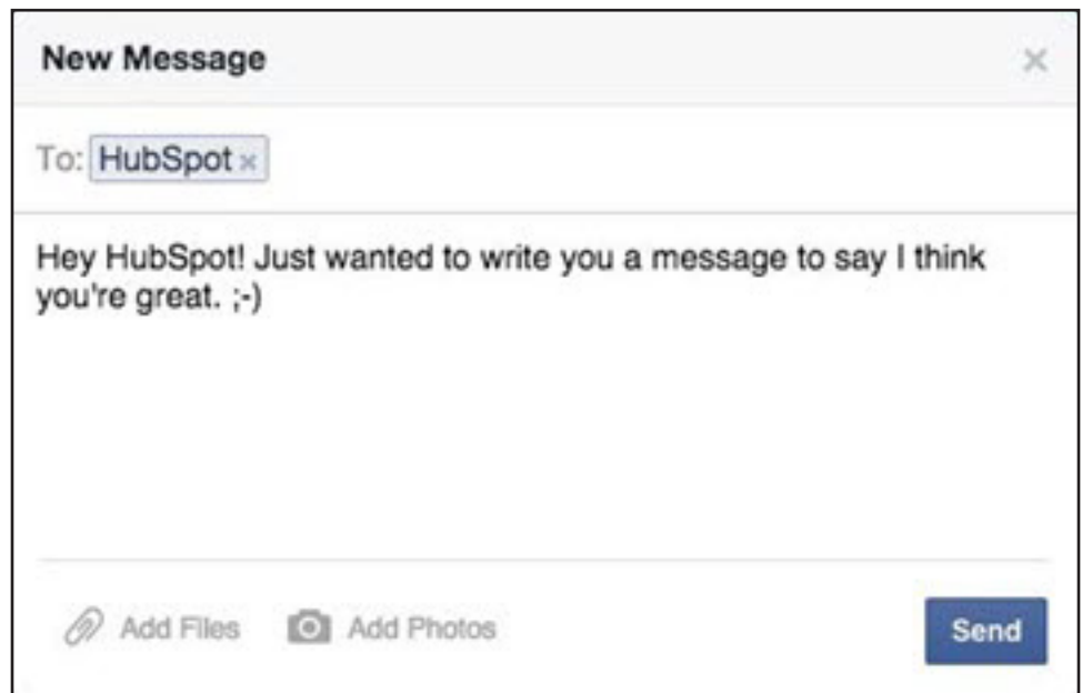
Figure 2. A Facebook private message window.

This is a very important piece to monitor, as this is where many fans will send support-related concerns and questions about your products or services. See Figure 2 below for an example of this.